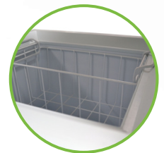
Optimal storage capacity and overview of the stored samples with the baskets.