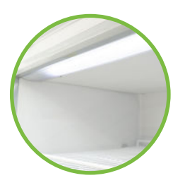
All models feature durable, cost saving LED lighting for better overview of your samples.