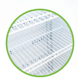
Easily adjustable shelves in order to offer best flexibility for your storage needs.