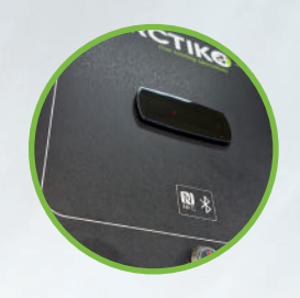
The Carel controller features Bluetooth connection, visual and acoustic alarms, high/low-temperature alarms, open-door alarms and a data logger.