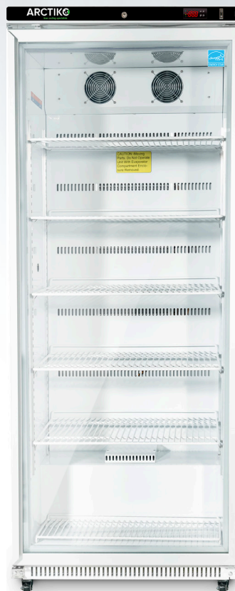
PRE 490-US ▲

Utilizes refrigerants that are fully compliant with the Environmental Protection Agency (EPA) and the Significant New Alternatives Policy (SNAP) regulations, ensuring environmentally responsible operation without compromising performance or safety.