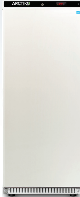
LFE 285-US ▲