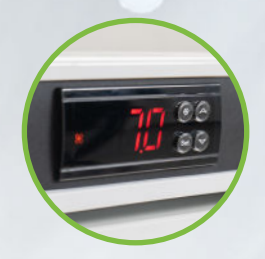
The digital controller features visual and acoustic alarms, high/low-temperature alarms, open-door alarms and a data logger.