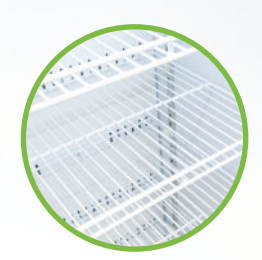
The shelves are easily adjustable to offer the best flexibility for your storage needs.