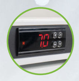
The digital controller features visual and acoustic alarms, high/low-temperature alarms, open-door alarms and a data logger.