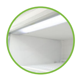
All models in our Flexaline range feature durable, cost saving LED lighting for better overview of your samples.